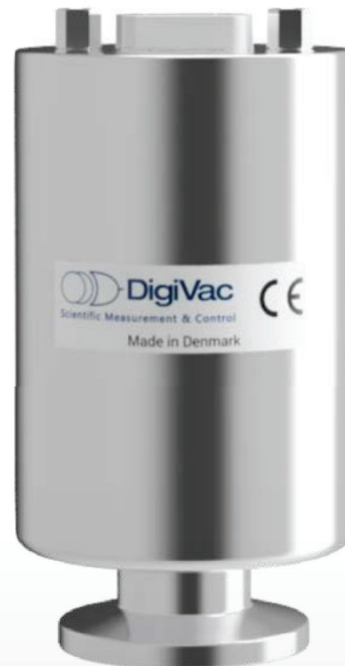
DuoSENS Capacitive Piezo